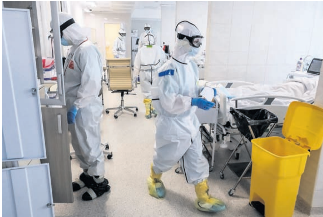
In this photo taken on Saturday, May 2, 2020, doctors work inside the intensive care unit for people infected with the new coronavirus, at a hospital in Moscow, Russia.